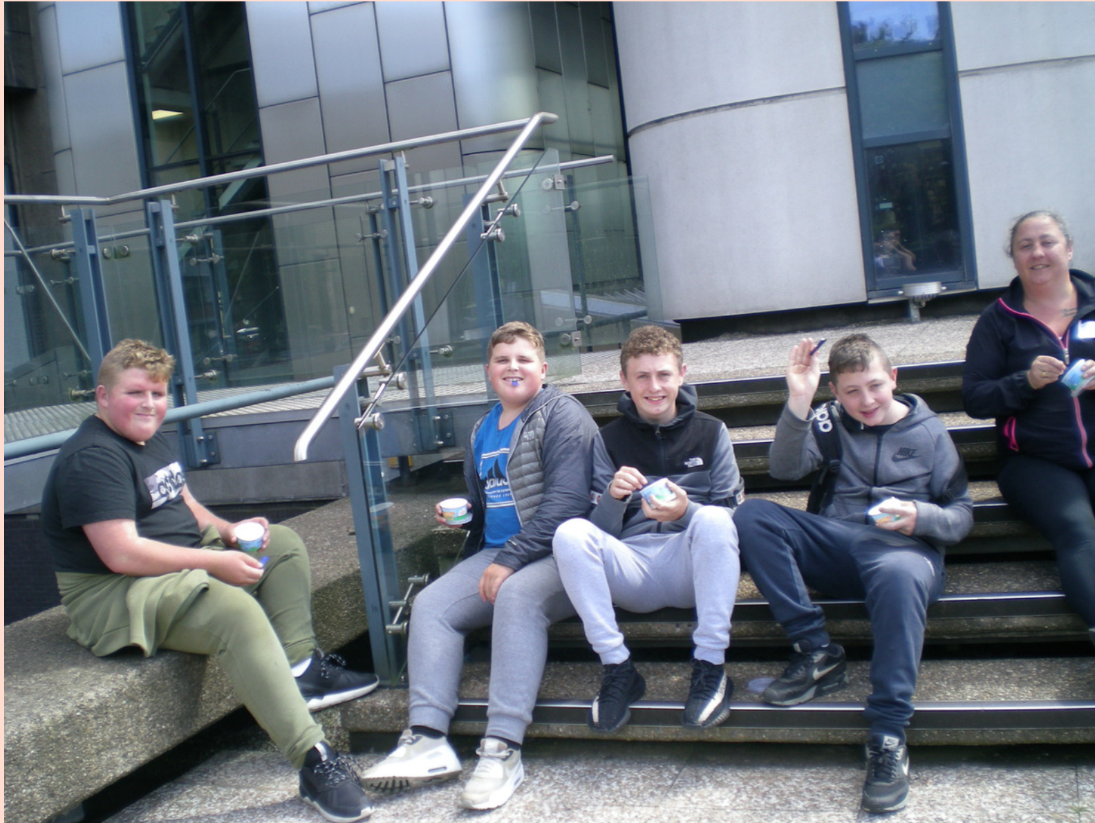
Big Local Film Festival Birmingham

YMCA North Tyneside continue to support the young people. They have had a fantastic year.