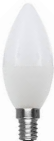
Small Screw (E14)