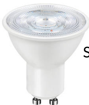
Spot Light (GU10)