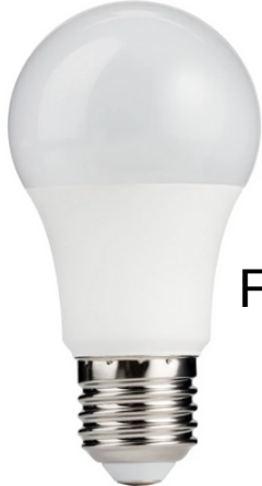
Fat Screw (E27)