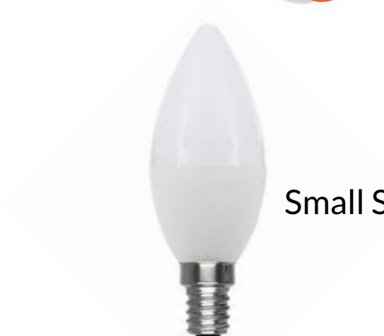
Small Screw (E14)