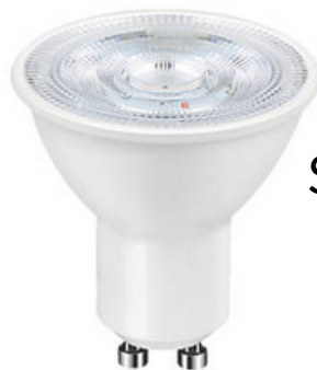
Spot Light (GU10)