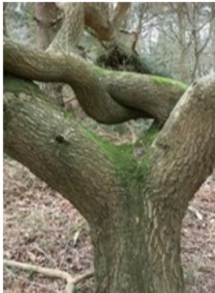
Cuddles "Let's wrap"