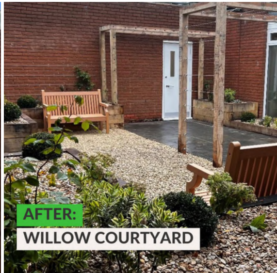
AFTER: WILLOW COURTYARD