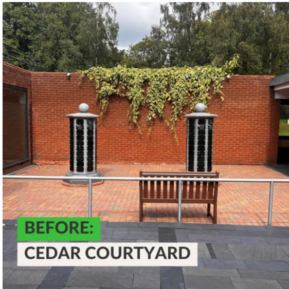
BEFORE: CEDAR COURTYARD