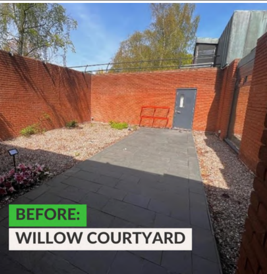
BEFORE: WILLOW COURTYARD