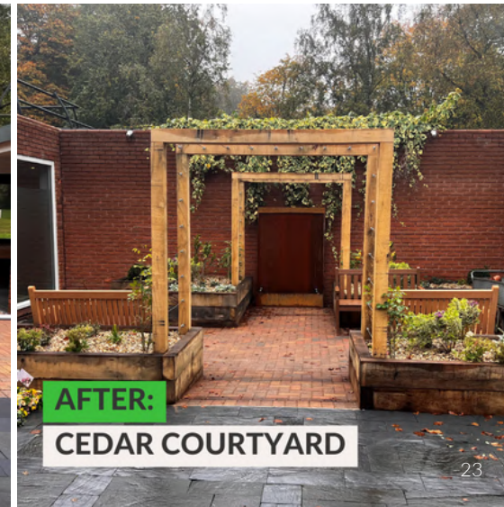
AFTER: CEDAR COURTYARD