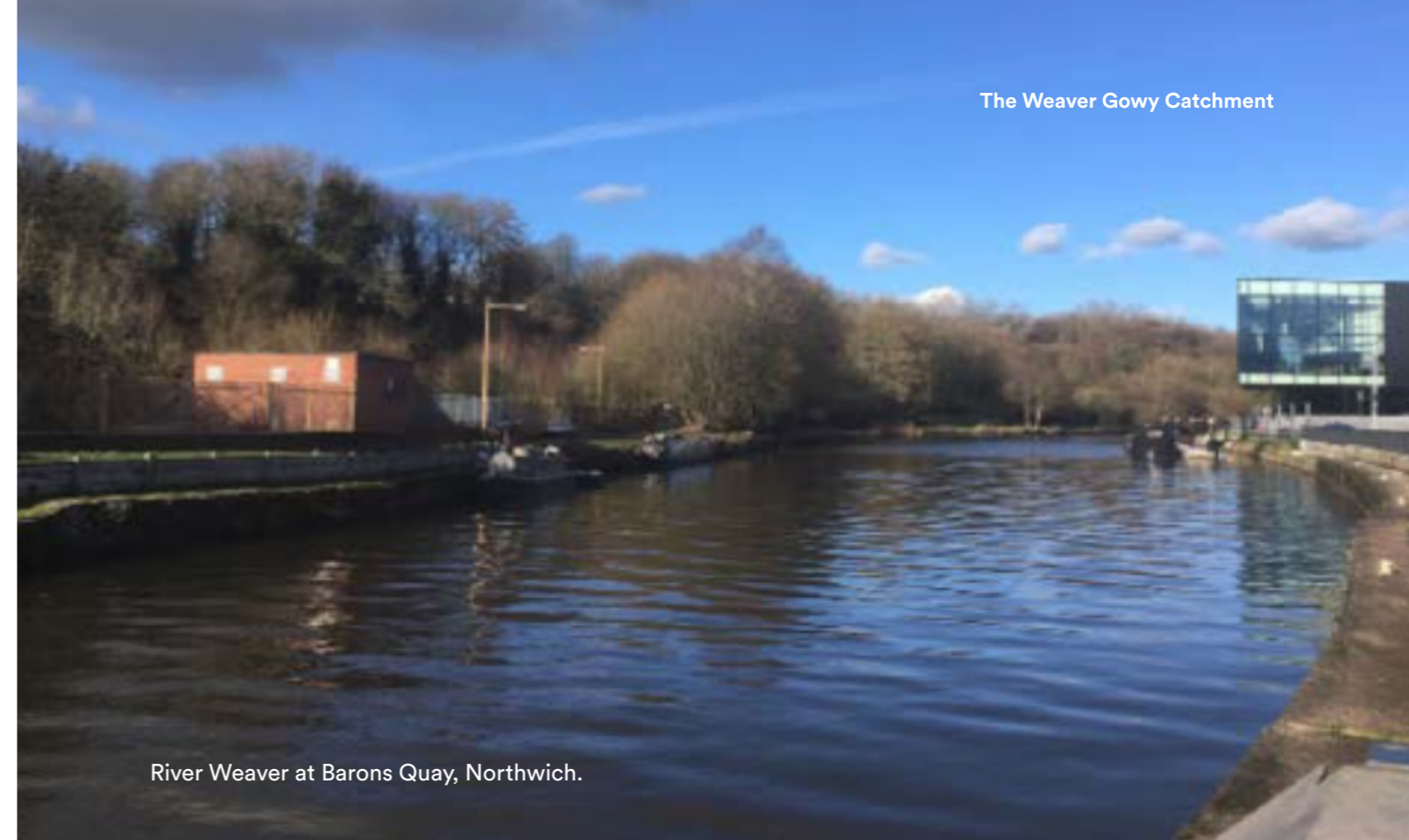
River Weaver at Barons Quay, Northwich.

The River Weaver flows through dairy farmed areas of Cheshire, through Nantwich and onto Winsford where it becomes impounded and navigable, joining the Manchester Ship Canal at Runcorn. The operational catchments are the Dane, Gowy, Lower and Upper Weaver.